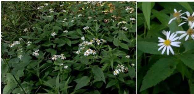
Forked Aster Eurybia furcata