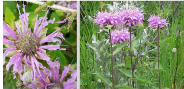
Wild bergamot Monarda fistulosa