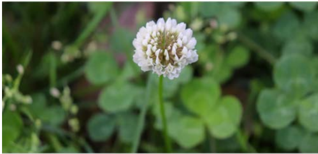
White Clover Trifolium repens