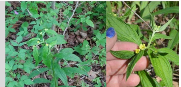
American Gromwell Lithospermum latifolium