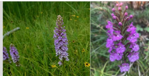
Lesser purple fringed orchid Platanthera psycodes