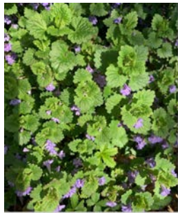
Creeping Charlie Glechoma hederacea