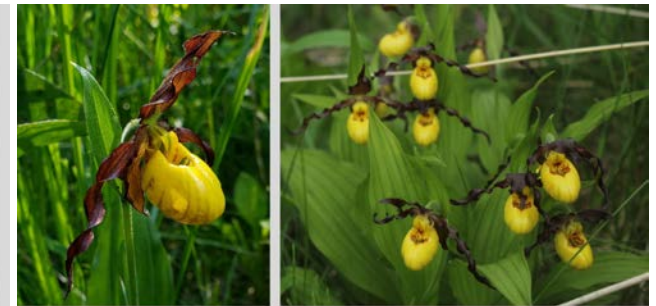
Lesser Yellow Lady Slipper Cypripedium parviflorum var. makasin